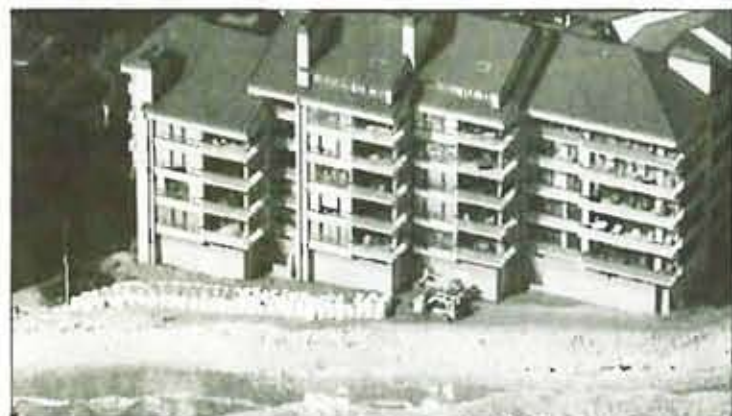
Sand bags line the area between The Ocean Club Villas and the ocean as the sand erodes.

Workers began scraping sand along the beach of The Links' 18th