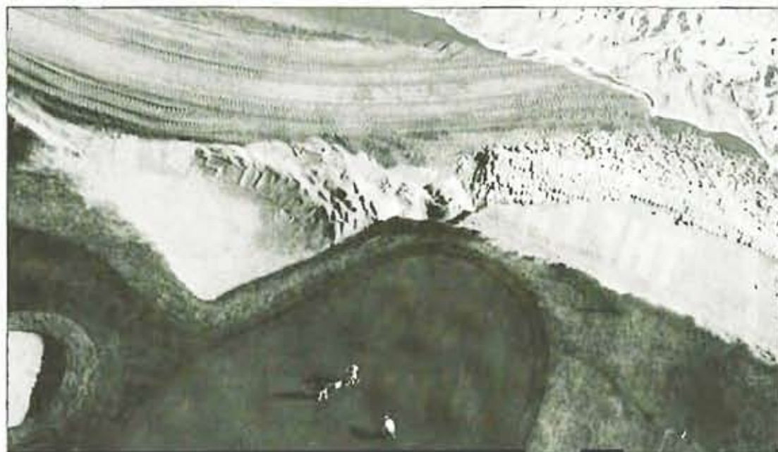
The 18th green at the Links Course at Wild Dunes is being threatened by beach erosion. Some residents of the gated community are against efforts being made to save the hole.